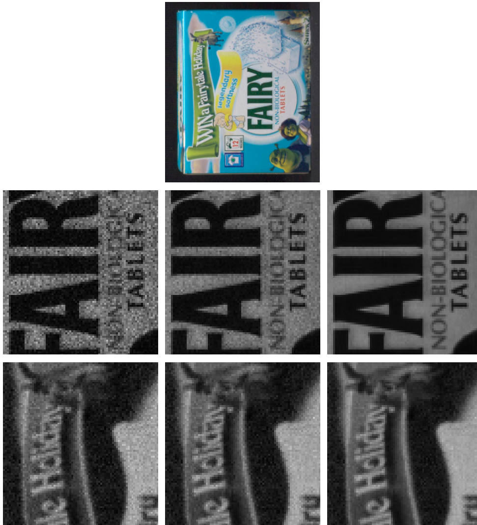
Figure 3. Results of multispectral image denoising of the test image number 18 from the database [8]. From top to bottom: MS image (sRGB values rendered under a neutral daylight, D65), fragment of the 1st spectral component, different fragment of 31st spectral component. From left to right: noisy image, denoised by multispectral modification of CBM3D and denoised by proposed algorithm.