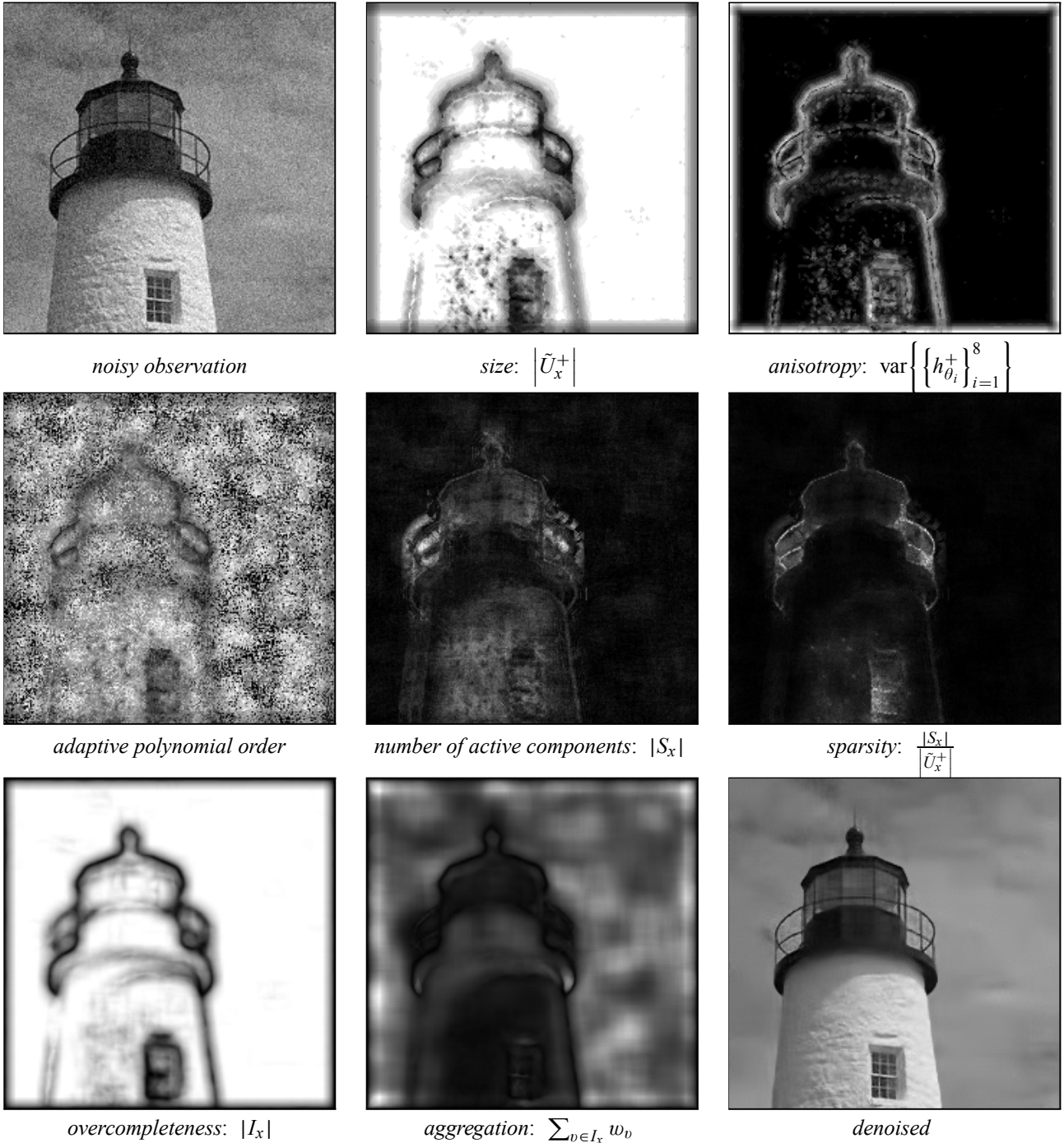
Figure 2: A visualization of some of the elements and concepts which appear in the proposed approach (see text).

can be expressed by the ratio \frac{|S_x|}{|\tilde{U}_x^+|} between the dimension of V_x and the size of the neighborhood. Sparser representations correspond to smaller ratios (shown as darker grays). Smoother areas of the image allow to achieve very sparse local estimates, regardless of the degree of their polynomial building elements \left\{ \psi_{\tilde{U}_x^+}^{(i)} \right\}_{i \in S_x} . Sharper details of the image, require instead a larger proportion of basis elements into the estimate.