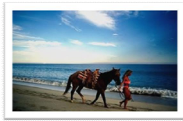
Fig. 1. A picture with various content.

significantly increases when the learning process is involved. Moreover, it should be noted that the user's preferences might vary in every query. For instance, the user might use the picture in Fig. 1 in order to search for horses . However the same picture can be used for searching beach or ocean another time. Therefore, if the system learns that this picture is associated with horses, future searches with this picture will yield results with more horses in them. This is a clear example of what is meant in Section 1 as "shaping users' behavior". However, users' interests and objectives are not the same at all times.