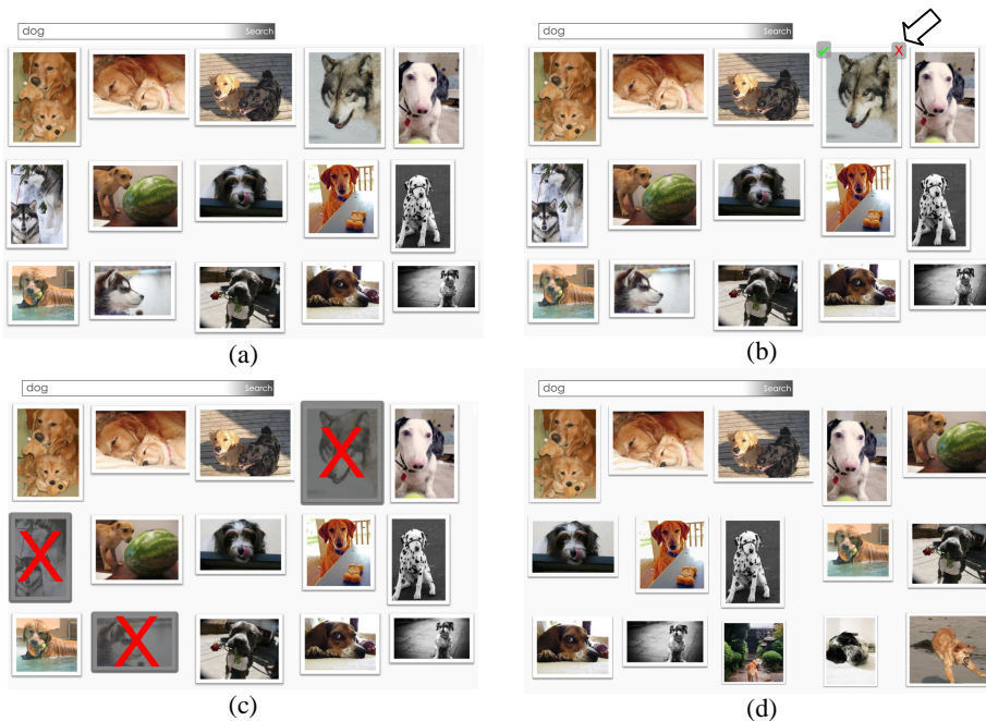
Fig. 2. An illustration of how negative feedback affects the results.

Users are expected to label the image(s) either positively or negatively according to their subjective preferences. For positively labeled image(s), it is assumed that user wants more images similar to that particular image(s), thus that image(s) will be used for presenting new images to the user dynamically. Similarly, users may negatively label the image(s) for their subjective preferences, meaning that such images are out of user's interest. Based on the negatively labeled images, particular images will be eliminated and new images will be introduced to the user by modeling the user's preferences. Fig. 2 demonstrates how a negatively labeled image updates the current query. Initial retrieval results based on text based search are shown in Fig. 2.a (Yet, we used only visual features in our experiments). User is provided to choose any image as preferred or non-preferred when hovered. In Fig. 2.b, the user does not prefer to have the image in his results and the system removes that image together with the ones having similar content (Fig. 2.c) and brings new images from lower ranks not including similar ones to the user's choice (Fig. 2.d).