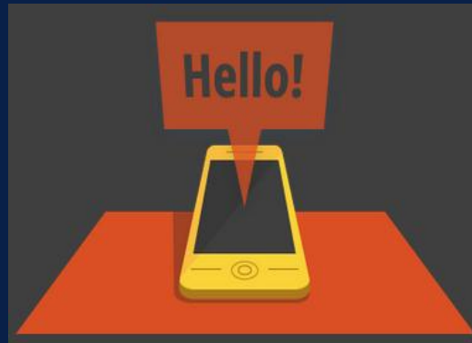
3rd Party Data Integration